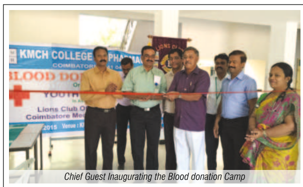
Chief Guest Inaugurating the Blood donation Camp