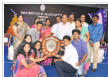
Blue Berry receiving the overall championship award

The eve was filled with the victorious breeze as the team Blue Berry bagged the champions title of Medifest 2014.