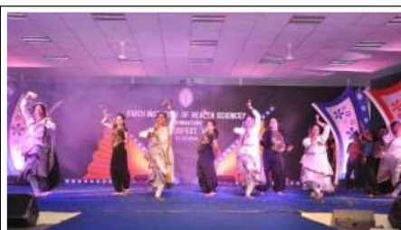
Students performing classical dance at Medifest 2014