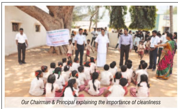
Our Chairman & Principal explaining the importance of cleanliness