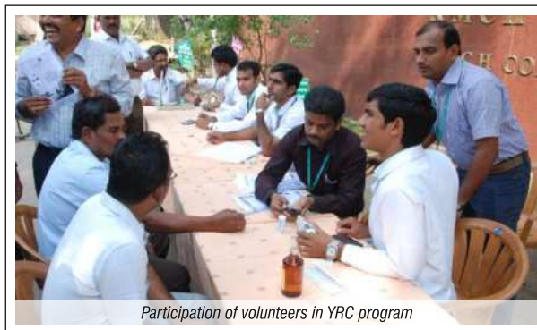
Participation of volunteers in YRC program

The programme was aimed at creating awareness about health & hygiene, diabetes, obesity and cessation of smoking among the local people.