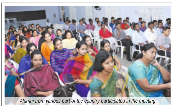
Alumni from various part of the country participated in the meeting

Alumni association meeting of KMCH College of Pharmacy was conducted on 7 th March 2015 with all its grandeur and splendor.