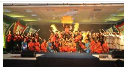
Students giving a stunning dance performance at Medifest 2014