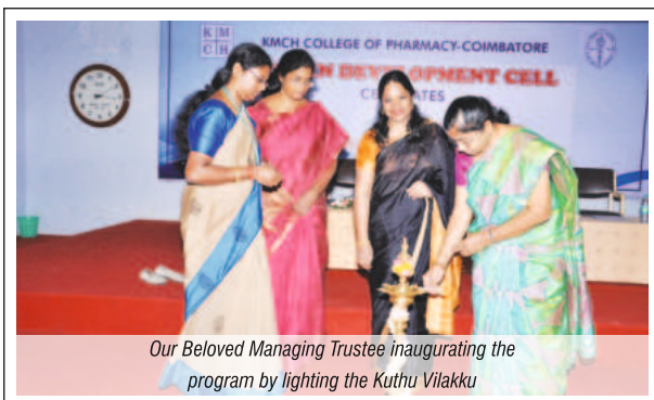
Our Beloved Managing Trustee inaugurating the program by lighting the Kuthu Vilakku