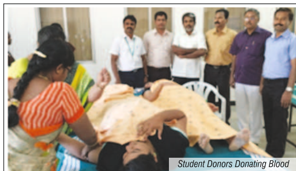
Student Donors Donating Blood

Donors were provided with biscuits, iron supplements and fresh juice. The certificates were issued to the donors by the Lions club, Coimbatore. Conduction of the blood donation camp in the college made the students understand the importance of blood donation and it gave them a chance to participate in such a noble act.