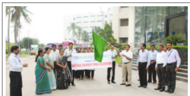
Our beloved chairman inaugurating the Rally conducted in connection with National Pharmacy week celebration

53 rd National pharmacy week was celebrated at KMCH College of Pharmacy from 16 th November to 23 rd November 2014. The theme of 53 rd pharmacy week celebration was "RESPONSIBLE USE OF MEDICINE; ROLE OF PHARMACIST".