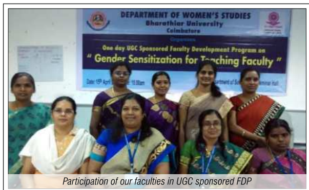
Participation of our faculties in UGC sponsored FDP