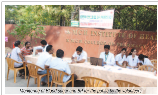
Monitoring of Blood sugar and BP for the public by the volunteers

The 'National Youth Day' was celebrated this year on 12 th January 2015. A health awareness programme and a free health check up for the public, was hosted by the Youth Red Cross Society of KMCH College of Pharmacy, as part of the day's celebration.