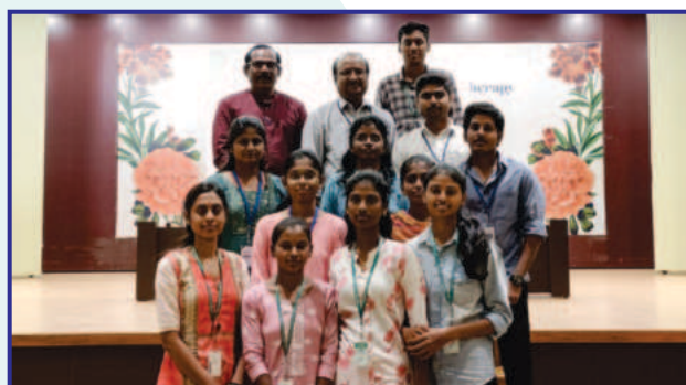
National conference at PSG College of Pharmacy.