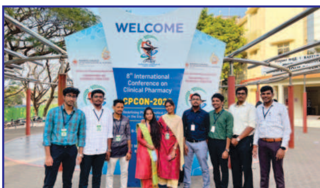
International Conference on Clinical Pharmacy