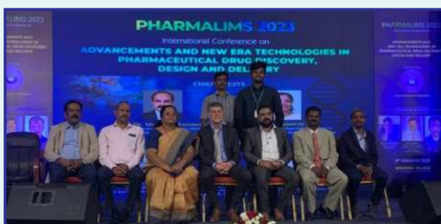
International Conference at Elims College of Pharmacy