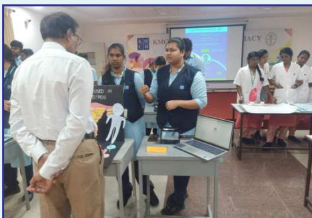
National Science Day Celebration