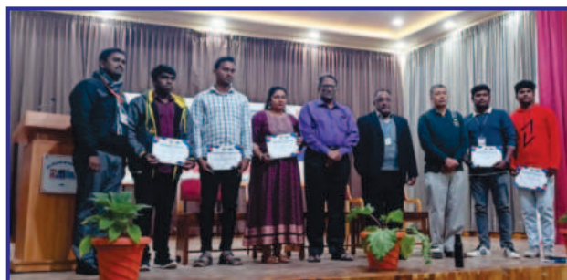
Training Program at JSS Academy of Higher Education

College of pharmacy, Ooty on 10 th and 11 th February 2023.