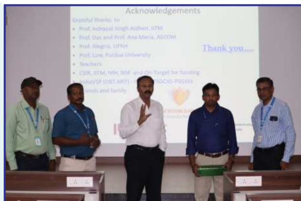
National technology day celebration