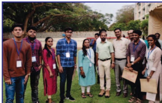
Seminar on Effective Teaching

“Effective Teaching, Learning, Strategies and Research in Pharmacy, organized by PSG College of Pharmacy”, Coimbatore on 01 st April 2023.