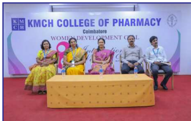
International Womens Day Celebration