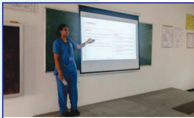
A Seminar on Critical thinking concept