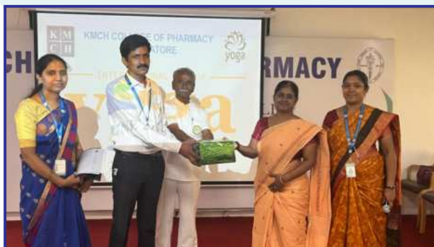
International yoga day celebration