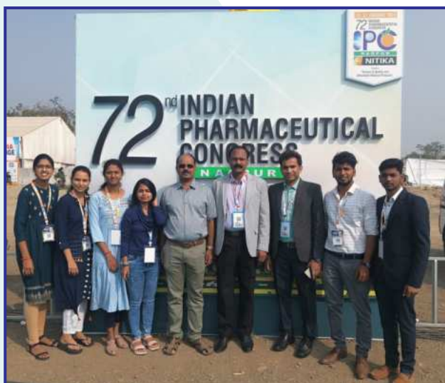
72 nd Indian Pharmaceutical Congress, Nagpur.