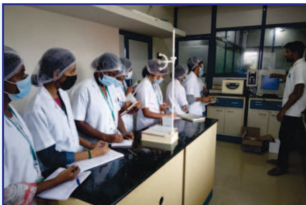
Hands on training - Areete Life sciences, Chennai.