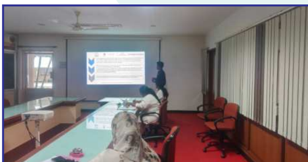
Conference on Clinical Practice