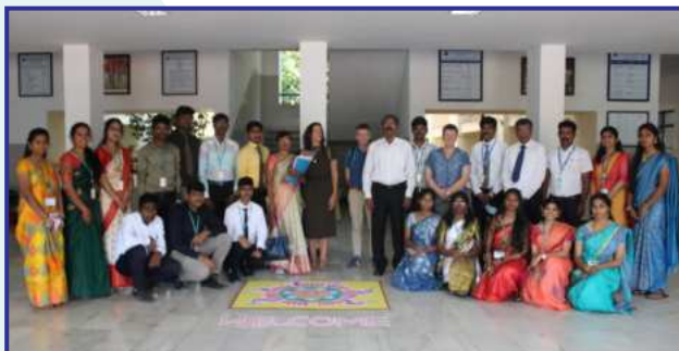
One day International level Seminar