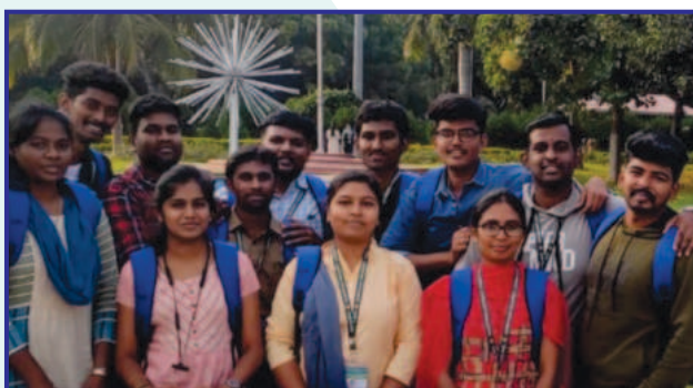
National Conference on Phytomedicine