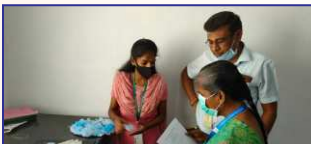
Innovation activities "Gold from Garbage" on National Pharmacovigilance Week Celebration