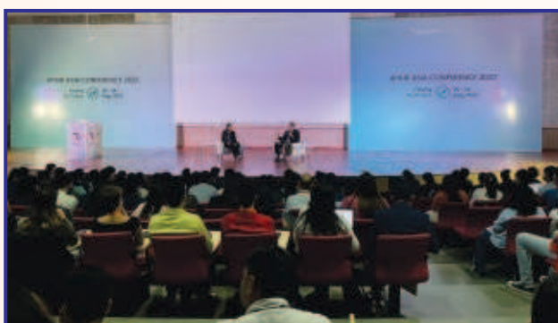
B.Pharm students attended HPAIR Asia Conference 2022 at New Delhi.