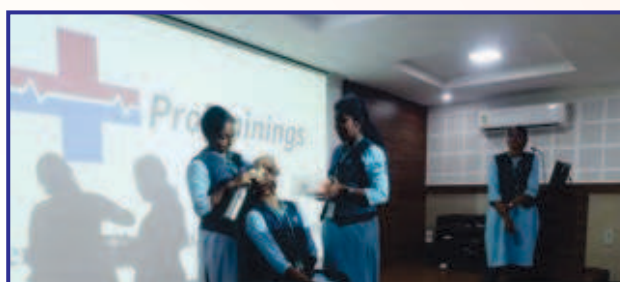
World First Aid Day Celebration, Pharm.D students sharing the importance of first aid.