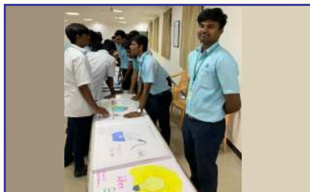
National Energy Conservation Day on 14 th December 2022