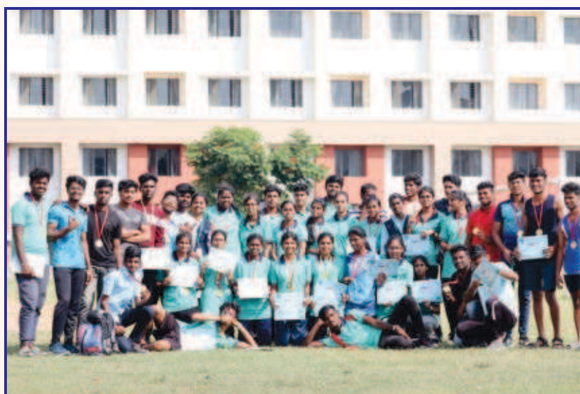
Medifest 2k22 sports at pavai arangam ground.