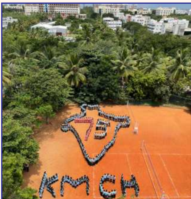
75 th Independence Day Celebration - Azadi Ka Amrit Mahotsav in college.

conducted and the winners were awarded with prizes.