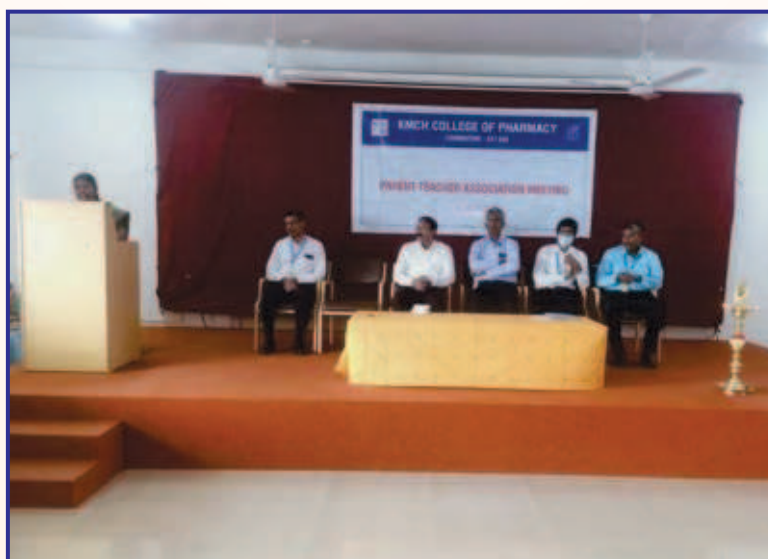
Parents Teacher's Association Meeting