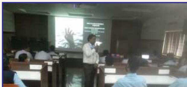
Students awareness programme about suicide on World Suicide Prevention Day