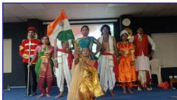
Students participated in Zonal level group skit competition, Azadi Ka Amrit Mahotsav Independence Day Celebrations – 2022