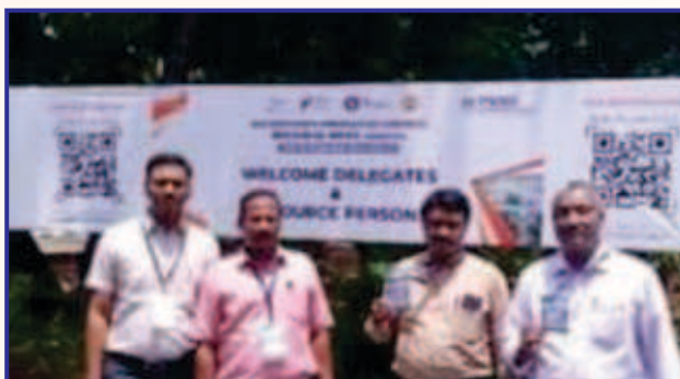
Staff participated in Institutions Innovation Council at PSNA College of Engineering and Technology, Madurai.