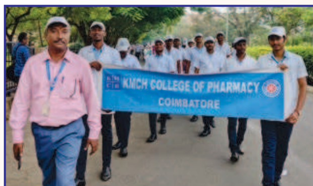
KMCH COP Organized National Pharmacy Week Celebration Rally.