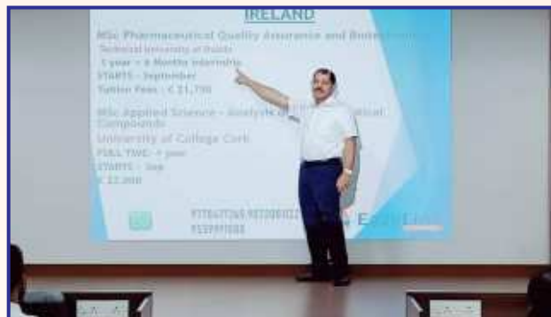
Interactive session regarding "Carrier guidance for international education" by Eazy link academy.