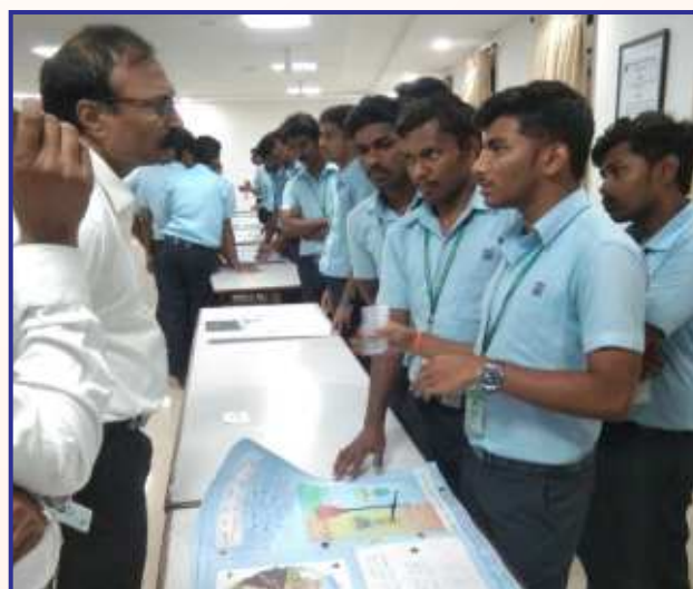
National Pollution Control Day Celebrated on 2 nd December, 2022.