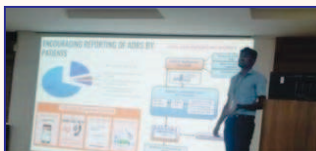
E-poster presentation on National Pharmacovigilance Week Celebration