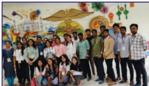
M.Pharm students attended a Preconference Workshop at Manipal College of pharmaceutical sciences, Manipal.