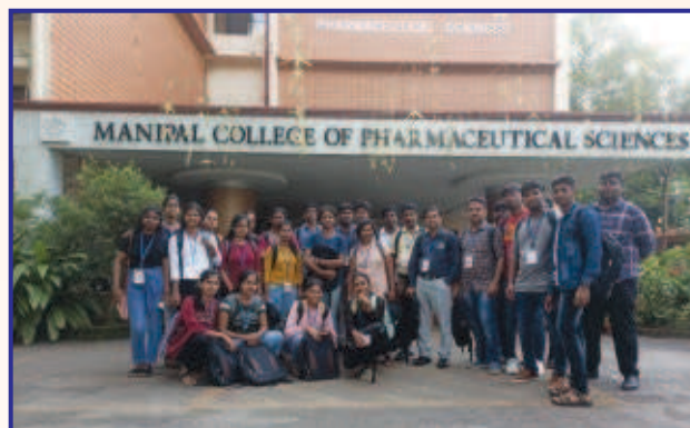
Staff and M.Pharm students attended a Preconference Workshop at Manipal college of pharmaceutical sciences, Manipal.