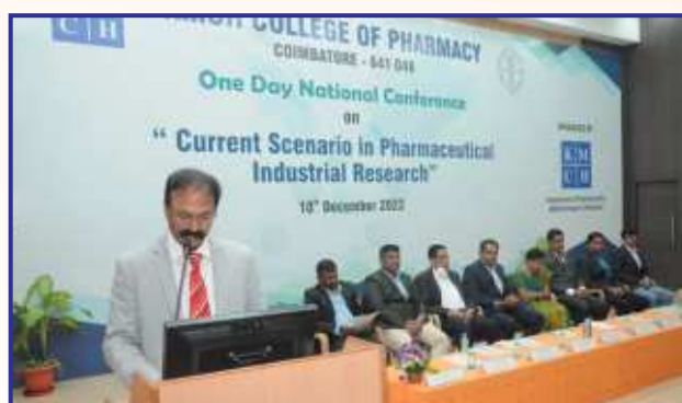
One day National Conference about 'Current Scenario in Pharmaceutical Industrial Research'.

Deputy GM, Bioplus Pvt Ltd, Bengaluru, were the resource persons. E-poster presentation was organised , for students from various colleges all over the India. At the end of scientific session, certificate with cash prizes were distributed to the best three scientific presentations.