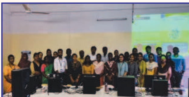
M.Pharm students attended a National conference at PGS College of Pharmacy, Coimbatore.