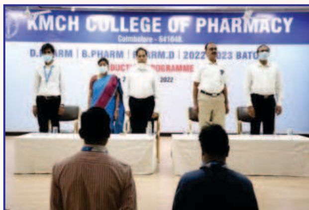
The induction programme for 2022-2023 batch held on 21 st Nov 2022