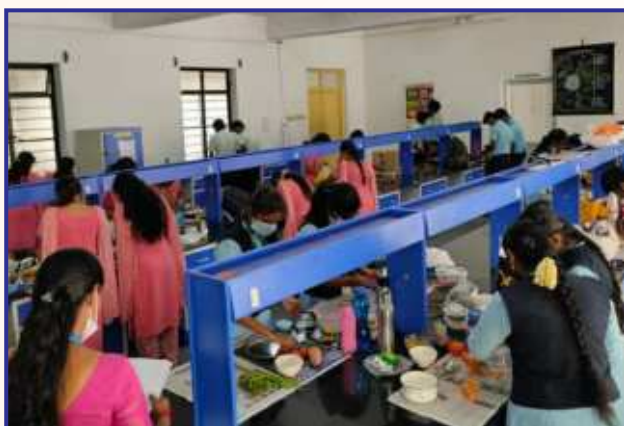
National Pharmacy week Celebration Cooking without Fire