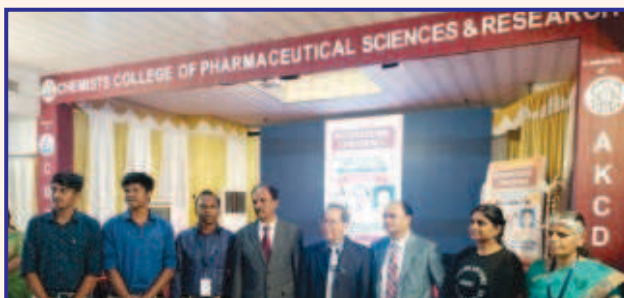
Staff and students attended a National conference at Chemists College of Pharmacy, Kerala.