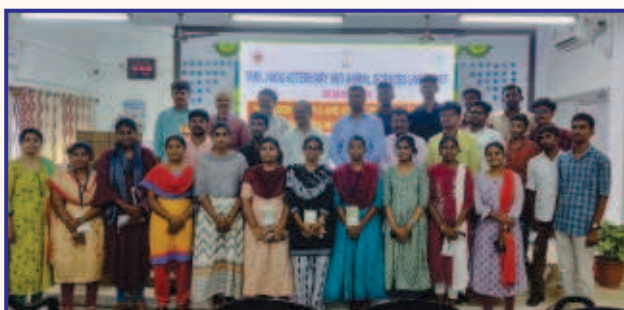
Staff and M.Pharm students, attended a national conference Veterinary College and Research Institute, Namakkal,.