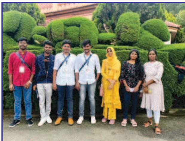
III Year B.Pharm students attended a National symposium at JSS college of pharmacy, Ooty.